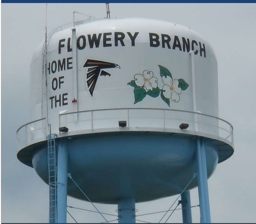
CITY OF FLOWERY BRANCH