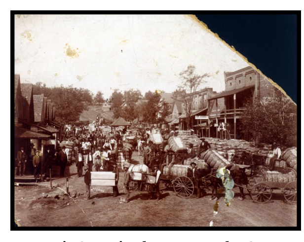
Main Street in Flowery Branch, 1899, was a bustling place of commerce.