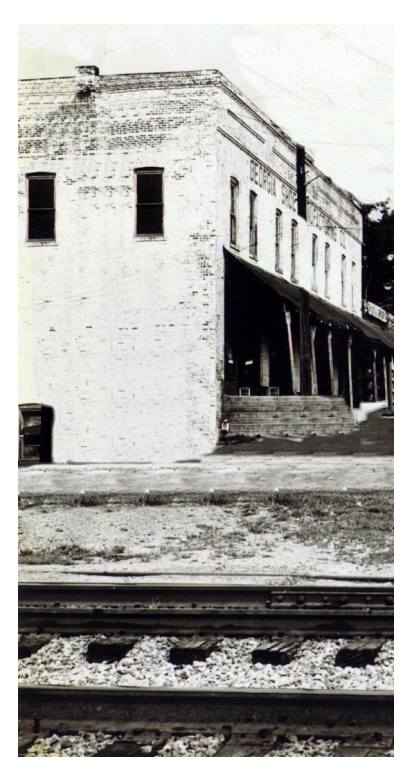
The Carlisle Building