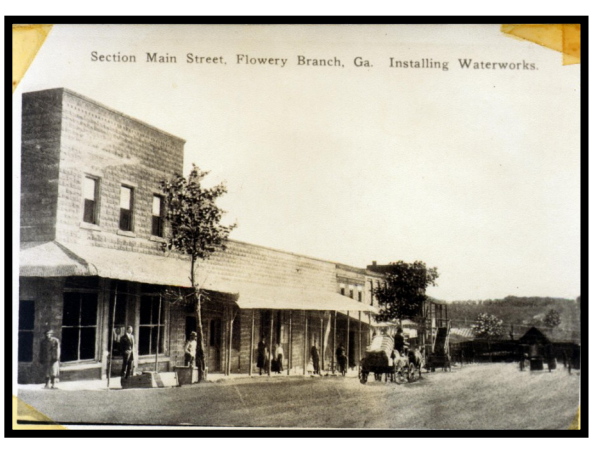
Main Street Flowery Branch, GA