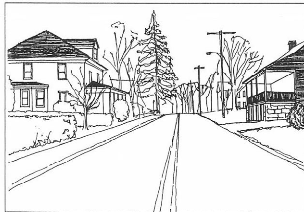
Source: Hill, John, W. Design Characteristics of Maryland's Traditional Communities, Figure 4, p. 5.1-2 in Time Saver Standards for Urban Design (New York: McGraw-Hill, 2003)

Consistent: Dwelling contains front porch and is located close to street. Minimal side yard setbacks. Garage is detached and located at rear of lot. Lot dimensions are 45'-60' in width and approximately 100'-130' in depth (6,700 to 7,500 square feet of lot area).